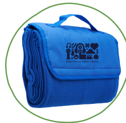
ADULTS Roll-up blanket (Perfect for outdoor programs!)