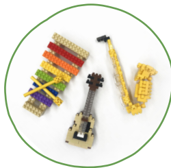
KIDS & TEENS (6+) Building block instrument (Choose one)